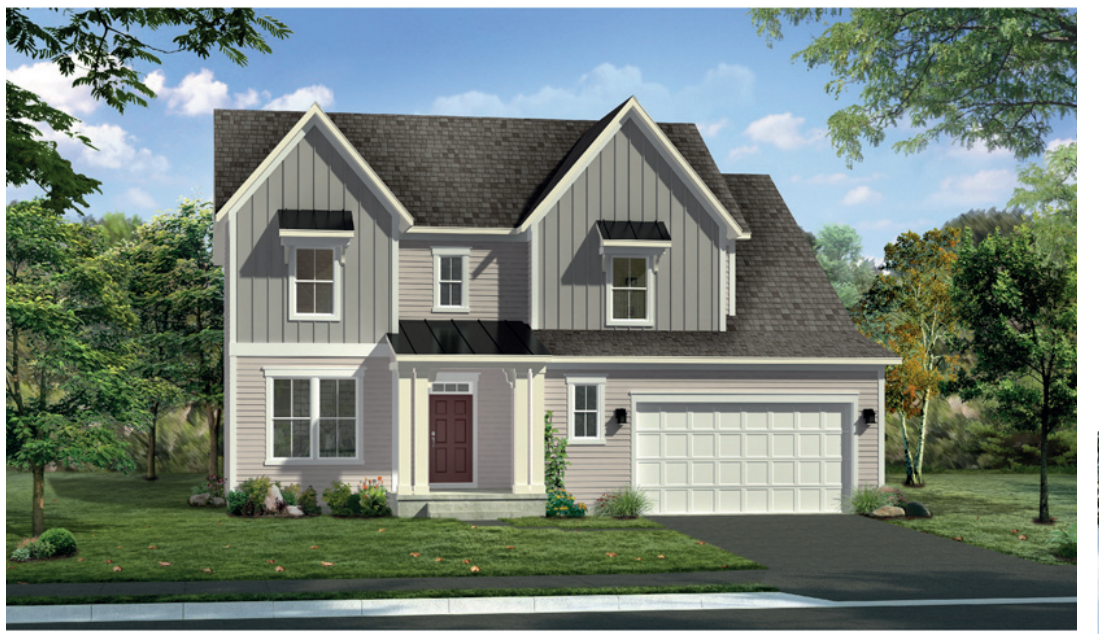
(shown with optional features)